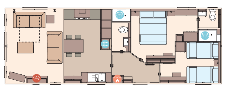
The Ambleside Premier 40ft x 14ft x 2 bedroom