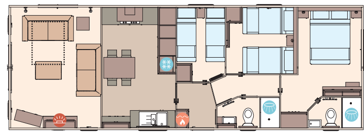
The Ambleside Premier 41ft x 14ft x 3 bedroom

OPTIONAL Residential specification BS3632 See Page 86