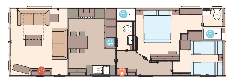
The Ambleside 40ft x 13ft x 2 bedroom