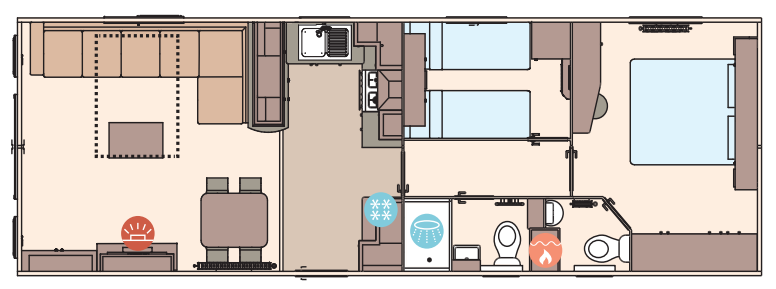
The Wimbledon 36ft x 12ft x 2 bedroom