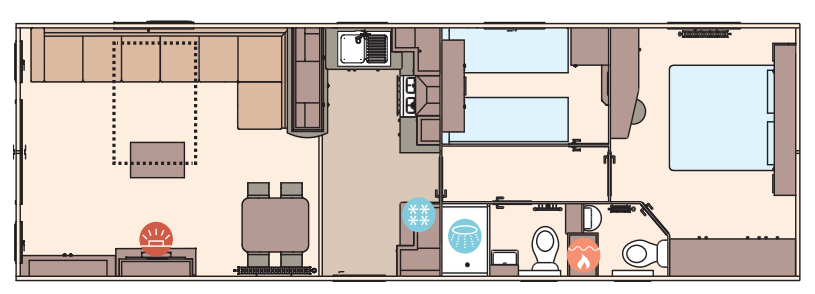
The Wimbledon 38ft x 12ft x 2 bedroom