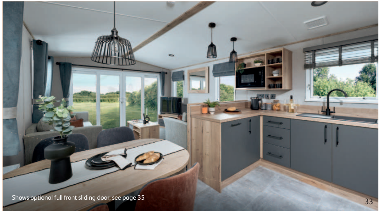
Shows optional full front sliding door, see page 35