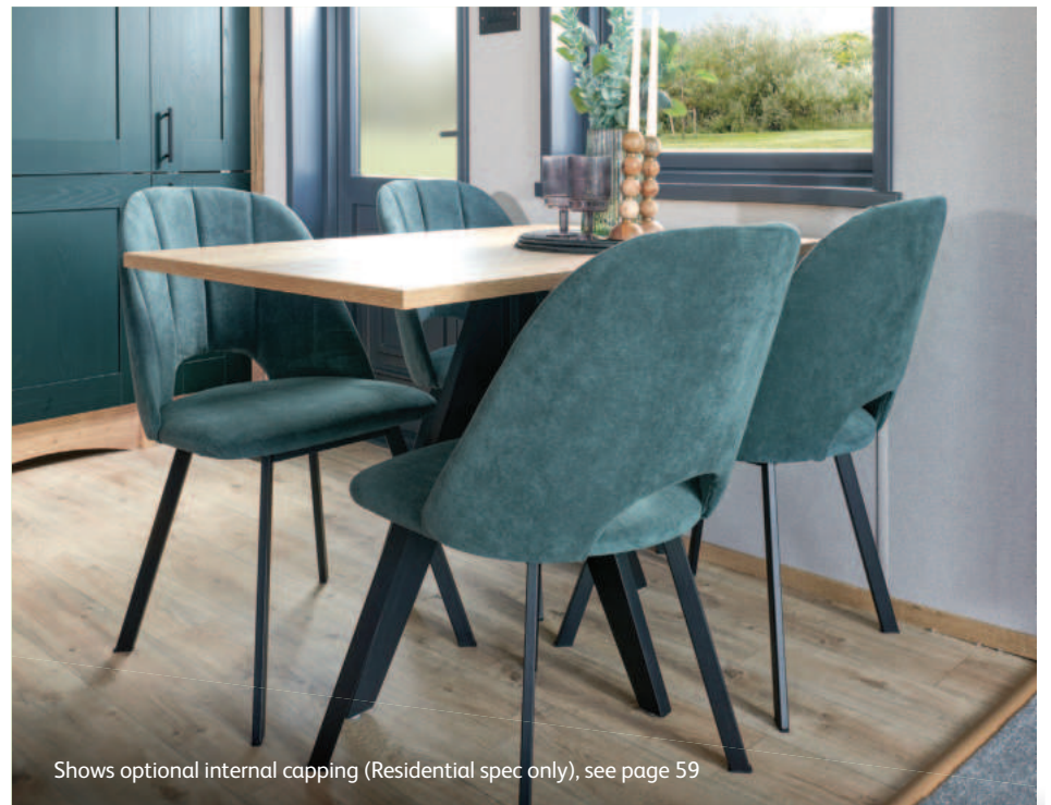
Shows optional internal capping (Residential spec only), see page 59