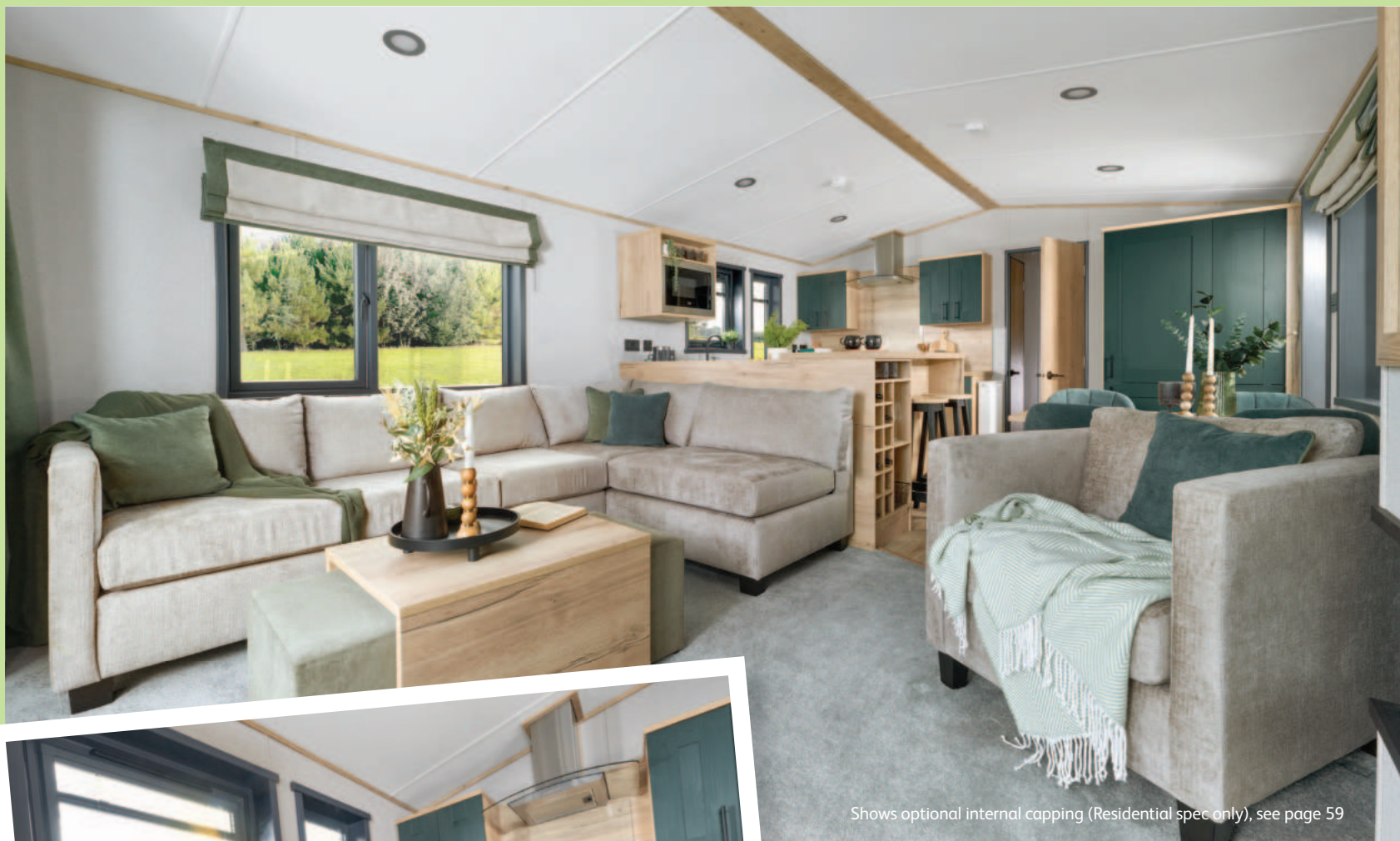
Shows optional internal capping (Residential spec only), see page 59