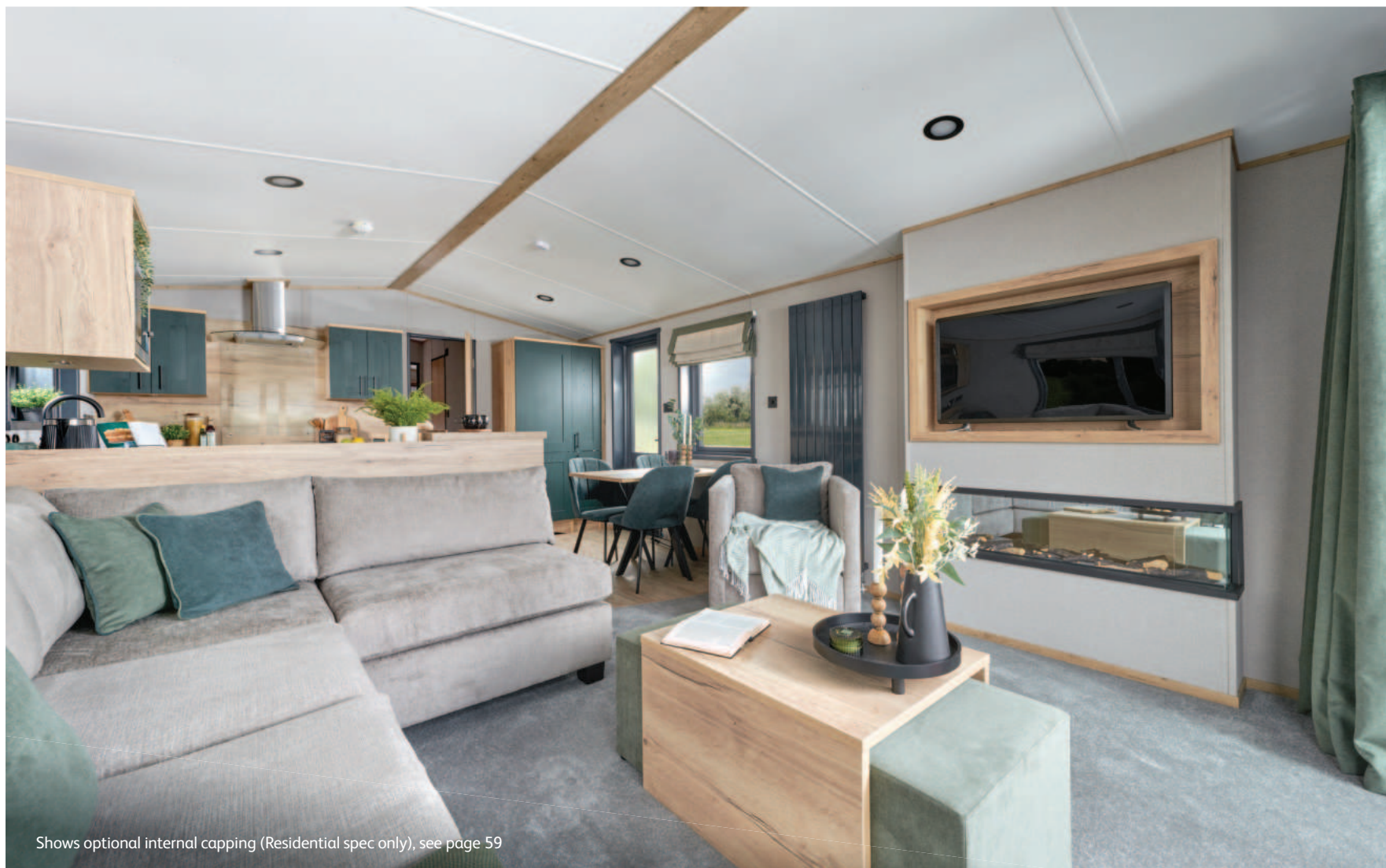
Shows optional internal capping (Residential spec only), see page 59