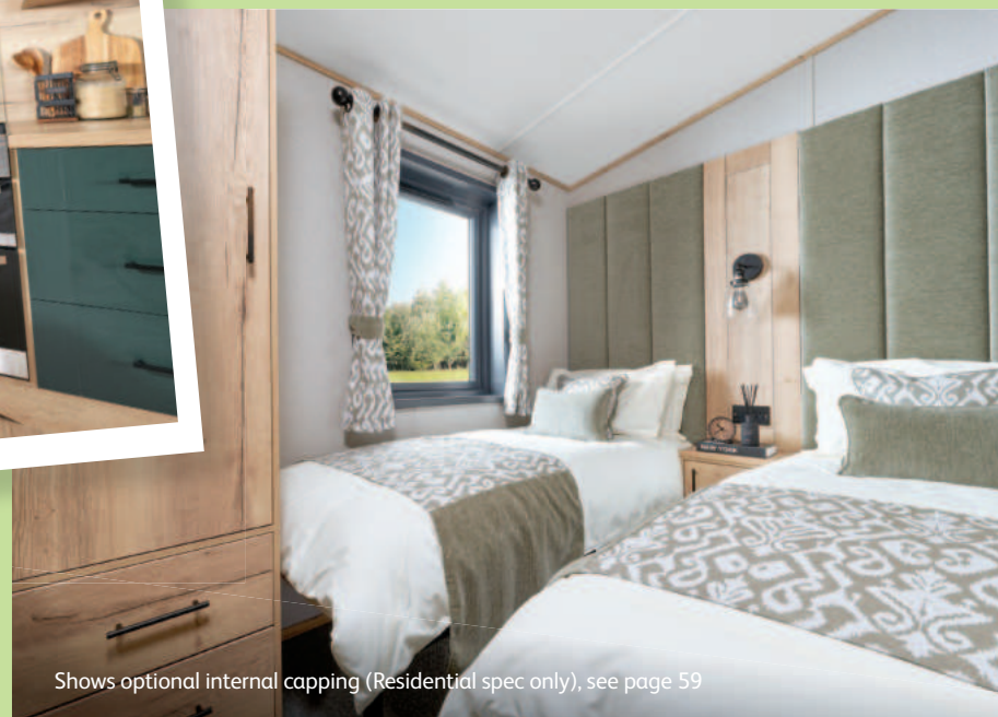
Shows optional internal capping (Residential spec only), see page 59

Please note: Some items featured in this photography are scene-setting props or optional extras, not included in your purchase. Please speak to your park or dealership or refer to the 'all this included' section for this holiday home.