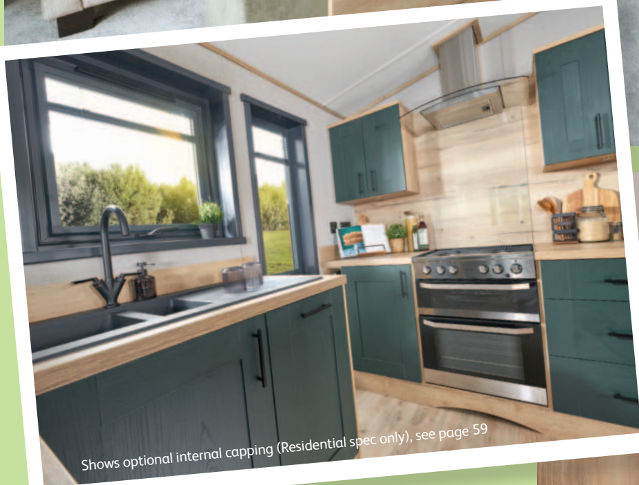
Shows optional internal capping (Residential spec only), see page 59